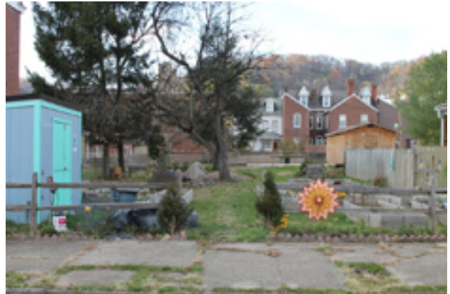
Community Garden on Butler St., Millvale