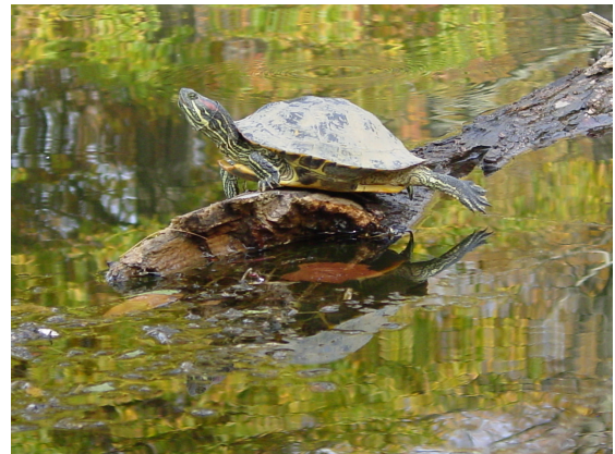
Turtle in North Park

May 7, Tuesday, 7:00 PM, Nike Missile Site Presentation & Tour. Meet at Police & Fire Academy located at 700 West Ridge Road. This event is back by popular demand again this year. Learn all about the air defense systems used to protect Pittsburgh during the cold war. Wear boots and bring a flashlight.