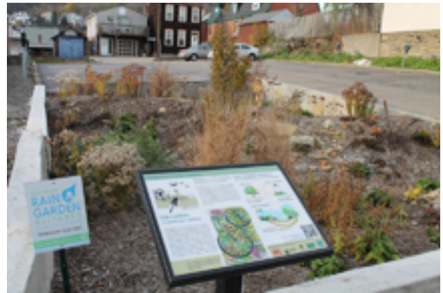
Rain Garden on Butler St., Millvale