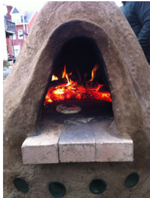
Oven made from cob, a mixture of clay-based soil, sand and straw, at the Community Garden