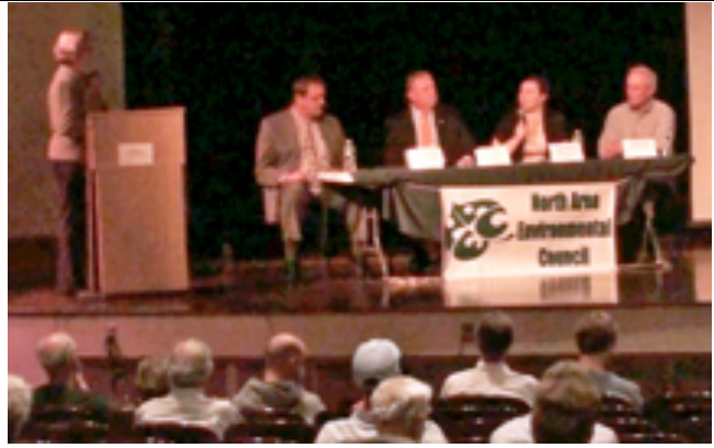
Moderator and panel discuss stormwater options