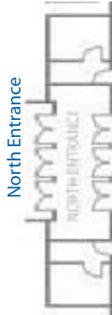
Exhibit Hall Map