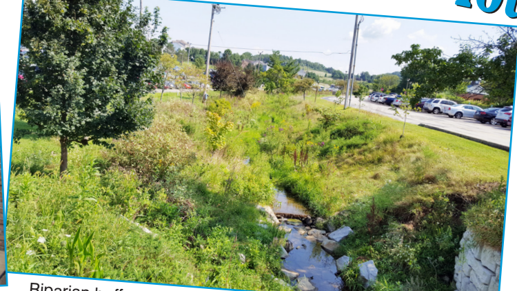
Riparian buffer at Westmoreland County Community College