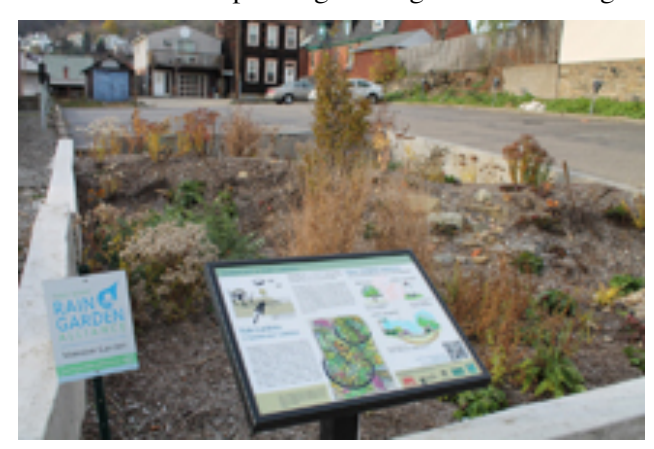
Rain Garden on Butler St., Millvale There are more of his photos from Millvale projects on page 6.

The innovative "Pivot Project" was unveiled to the public at a community meeting in early November, and will guide Millvale's eco-district planning efforts. Through the three pronged approach of water-food-energy Millvale will be looking at ways to become a more sustainable community.