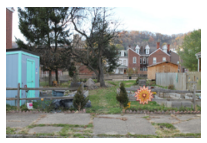
Community Garden on Butler St., Millvale