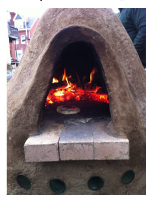
Oven made from cob, a mixture of clay-based soil, sand and straw, at the Community Garden