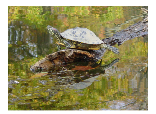
Turtle in North Park

April 2, Tuesday, 7:00 PM , FoNP Meeting . Join us at the Cabin for an update on issues related to the ecological protection and restoration of the Pine Creek Watershed. North Park Lake and the surrounding streams are at the center of this 67-square mile watershed.